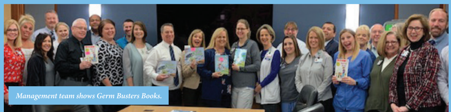
Management team shows Germ Busters Books.