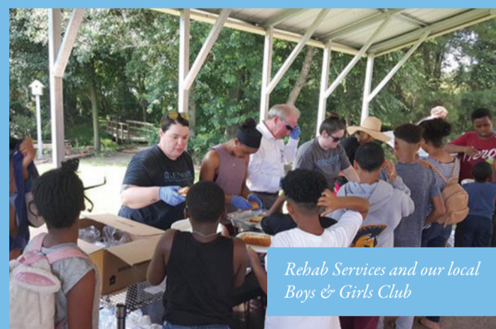
Rehab Services and our local Boys & Girls Club

UNC Lenoir Health Care Community Walking Track Averages over 500 walkers per month. Offered the use of the track for not-for-profit community organizations' walks x 3 in FY 20 for no fees.