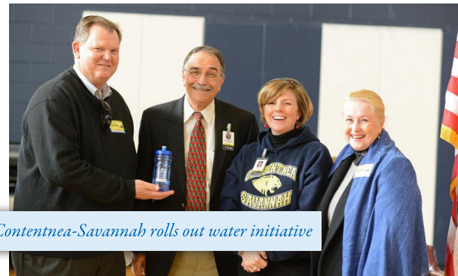
Contentnea-Savannah rolls out water initiative

Lenoir Memorial is an active partner in the Lenoir County Childhood Obesity Prevention Task Force that has representatives from the local schools, county government, and other key community agencies. A second school-wide healthy water beverage initiative was started at Northeast Elementary this year. More information about the activities of the task force can be found at http://www.lenoircountynchealthkids.com .