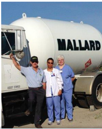
Corporate Health nurses visit local employers

Services included 79 corporate clients, 239 worksite wellness visits with 2276 employee contacts. Flu shots, CPR training, and targeted health education sessions for risk factor reduction were provided.