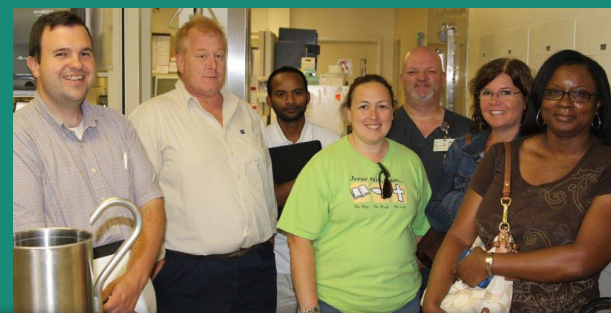
STEM education leaders observe technology at Lenoir Memorial

Lenoir Memorial worked with the Lenoir County Manufacturing Association to reward Lenoir County Project Lead the Way programs with science, technology, engineering and math (STEM) programming in area high schools through support for creative student project competition and scholarship awards. Lenoir Memorial also served as a site for a Lenoir County Public Schools STEM partnership with ECU showcasing careers in STEM based areas. Additionally, LMH provided support for STEMEAST through the Lenoir Committee of 100.