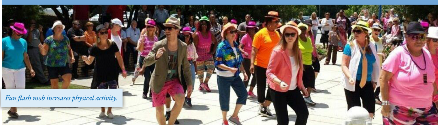
Fun flash mob increases physical activity.

A comprehensive health library is located at www.lenoirmemorial.org . This free community resource contains national health news headlines and articles, condition guides, and interactive calculators and quizzes to help assess current health knowledge and status. Calculate a Body Mass Index or Target Heart Rate. Check out the Health Library for popular topic areas such as women's health, men's health, pregnancy, diet and exercise, and dozens of more relevant topics to easily print articles.