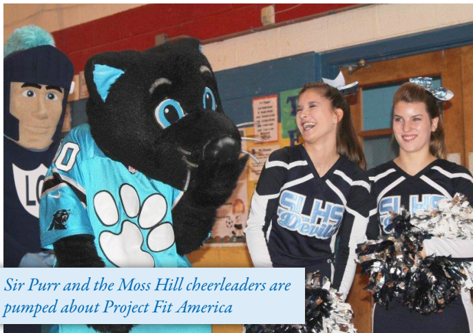
Sir Purr and the Moss Hill cheerleaders are pumped about Project Fit America

Project Fit America was implemented at the second Lenoir County school on November 19th, 2015 in Moss Hill Elementary in rural Moss Hill via a partnership with Lenoir Memorial. Support for the project came through funding from the Lenoir Memorial Foundation.