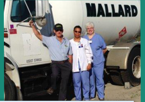
Corporate Health nurses visit local employers

Vitalboards are a lifesaving reusable tool that is used in the home to provide basic yet vital health information and information about medications that could be required in an emergency. A decal is placed at the entrance to the home alerting EMS to the presence of a Vitalboard in the home.